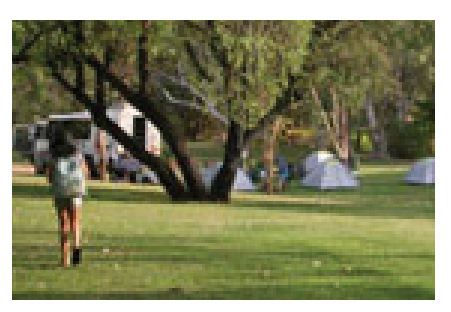
Those on Camping Plus will settle into the new Safari Tents at the Fitzroy River Lodge. These offer a basic accommodation upgrade option for travellers looking for a little extra comfort. They feature beds with pillows and linen and shared facilities.

Our Campers will set up the dome tents & swags in the grassy grounds of the Fitzroy River Lodge. On site ablutions have hot showers and flush toilets.